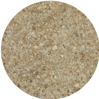
'Country Tan' exposed aggregate concrete