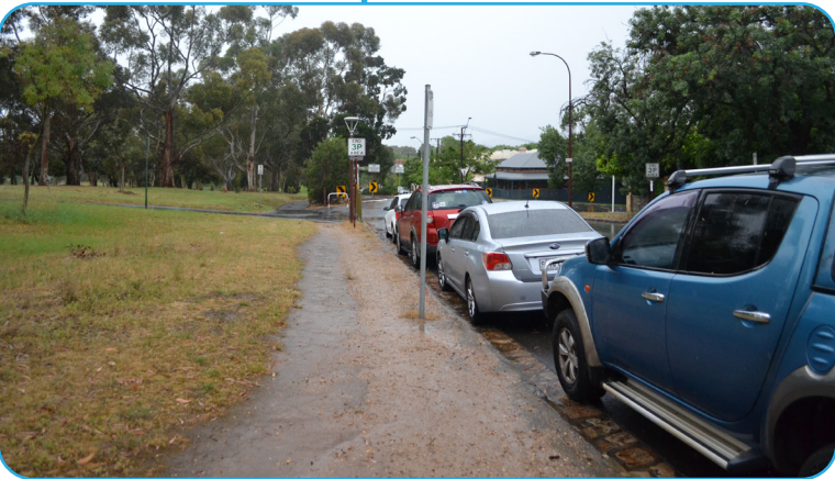
View of existing parallel parking where new stop 5A is proposed