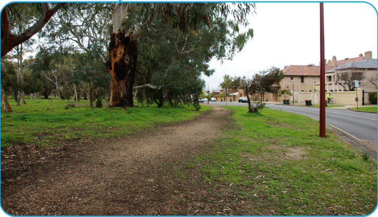
View of existing gravel path to existing bus stop